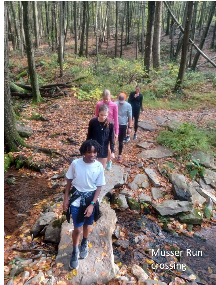
Musser Run crossing

The 3-mile loop is challenging, and we had to walk parts of the trail going to the top of the ridge, but it was worth the view. Some trail running skills came in handy, and we successfully made it back to the bridge with only one light tumble by Kristina.