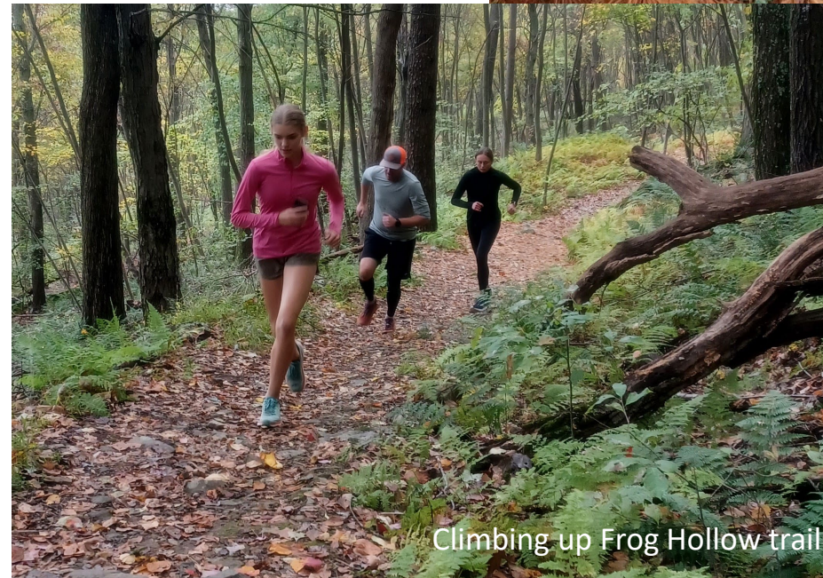
Climbing up Frog Hollow trail